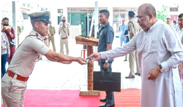
IT News Imphal, Oct 4:

Chief Minister N. Biren Singh flagged off 12 GPS enabled highway patrol vehicles from the Western Gate of the Chief Minister's Secretariat today. The patrol vehicles flagged off today, under phase-III, included 3 for Tamenglong District, 3 for Noney District, 2 for Kangpokpi District, 2 for Senapati District and 2 for Tengnoupal District.